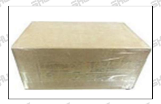
Pic No. 4 Domestic Express Packaging: Wrapped with transparent tape

A Minors are prohibited from using transparent tape, yellow tape, black wrapping protective film, and white wrapping protective film to avoid personal injury.