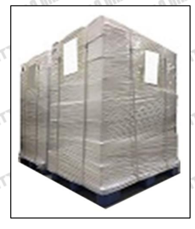
Pic No. 6

Pallet Shipping: Use pallet that meet export requirements, and use white wrapping protective film to wrap and bind with cable ties