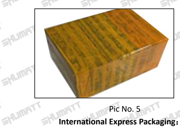
Pic No. 5 International Express Packaging: Wrapped with yellow tape after wrapping black protective film