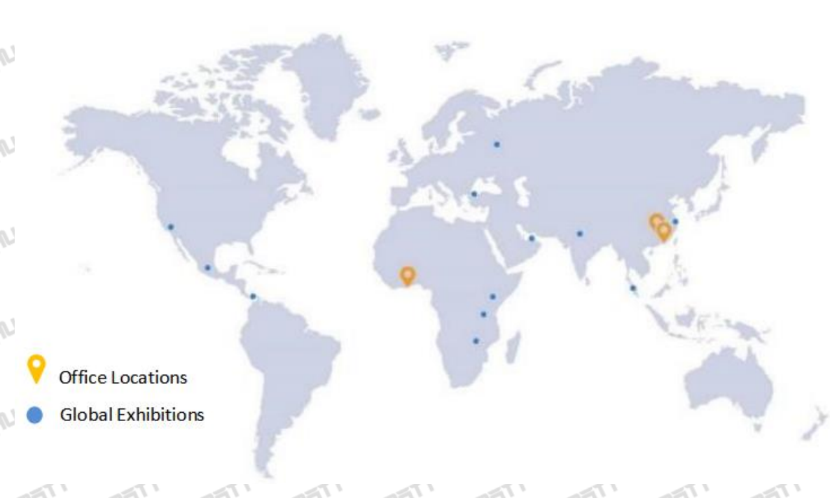
Pic No. 7